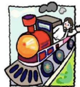
New Creation Station Child Care

State required renovations continue. We just finished putting new carpeting where it was required and cleaned the carpets in other areas.