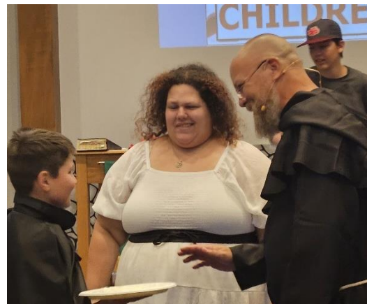
Recognize these Medieval characters?